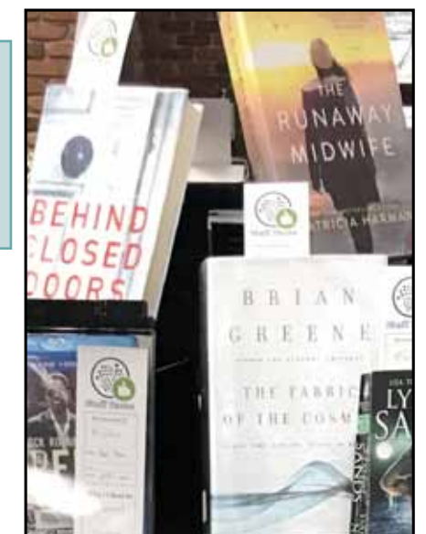
Browse the "Staff Faves" and take home one of our latest recommendations.

Have questions about the status of your library account? Contact MRL at 966-8291 or email at library@MRLinfo.org .